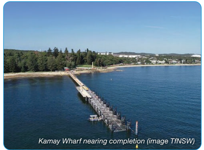
Kamay Wharf nearing completion

As well as allowing for a ferry connection across Botany Bay, the wharves will also improve access for locals and visitors in small commercial and recreational boats and for people to swim, dive, fish, walk and enjoy the local sights.