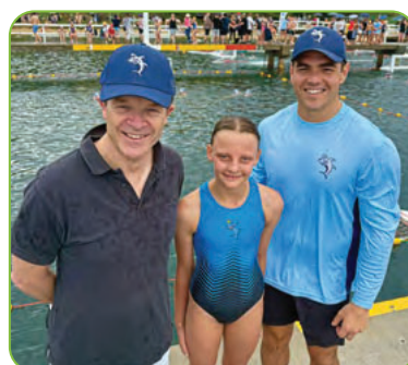
Cronulla Water Polo