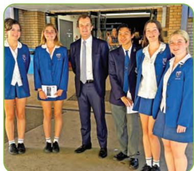
Woolooware High School