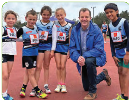
Port Hacking Little Athletics