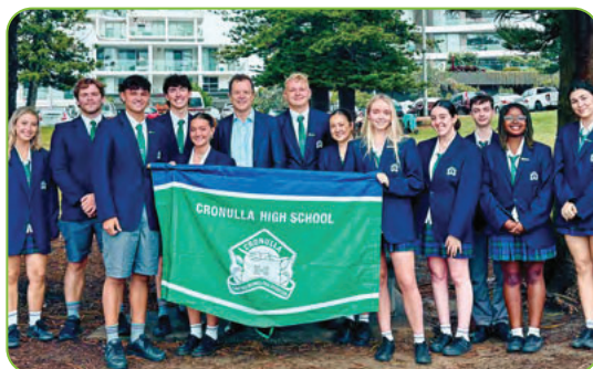
Cronulla High School