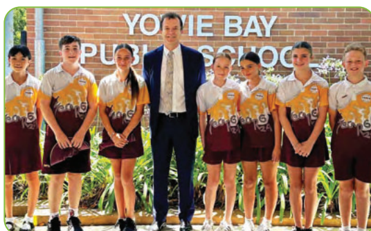
Yolie Bay Public School