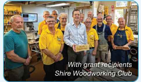
With grant recipients Shire Woodworking Club

Find out more about the 2025 CBP grants and how to apply on the program website by scanning the QR code right.