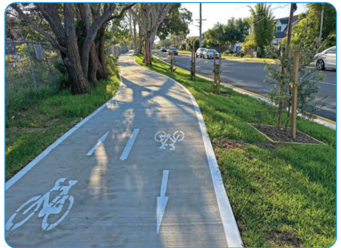
SCATL along Denman Avenue Caringbah

Last year the 3km Stage 2 East (Jackson Avenue Miranda to the Gannons Road/Denman Avenue intersection on the Caringbah/Woolooware boundary) was opened. The project has also helped improve the streetscape along the route. The other completed part is 1.3km section between Sutherland and Kirrawee.