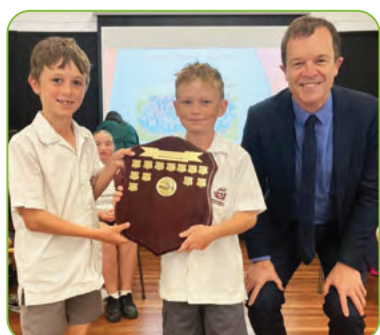
Kurnell Public School