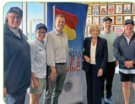
Wanda Surf Life Saving Club