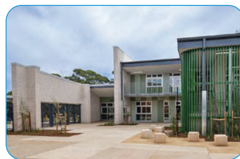
Above and below: new 'Building L' (images School Infrastructure NSW)

The new 'Building L' was used from Term 3 last year and followed the opening of the new 'Building M' for the start of 2024. Across the two buildings there are ten new classrooms, as well as staff spaces, student and staff amenities, a new canteen, an administration area and new staff car park.