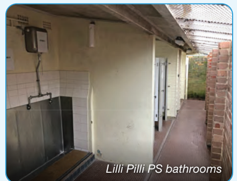
Lilli Pilli PS bathrooms

I raised the matter in Parliament a number of times and I was pleased to receive a reply from the Education Minister saying the project has now been funded.