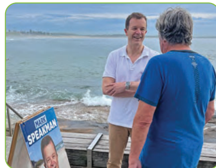
Community consultation – Cronulla Beach