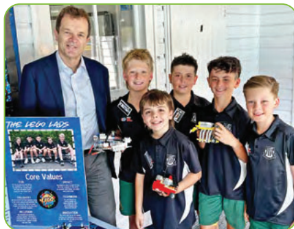
Lilli Pilli Public School