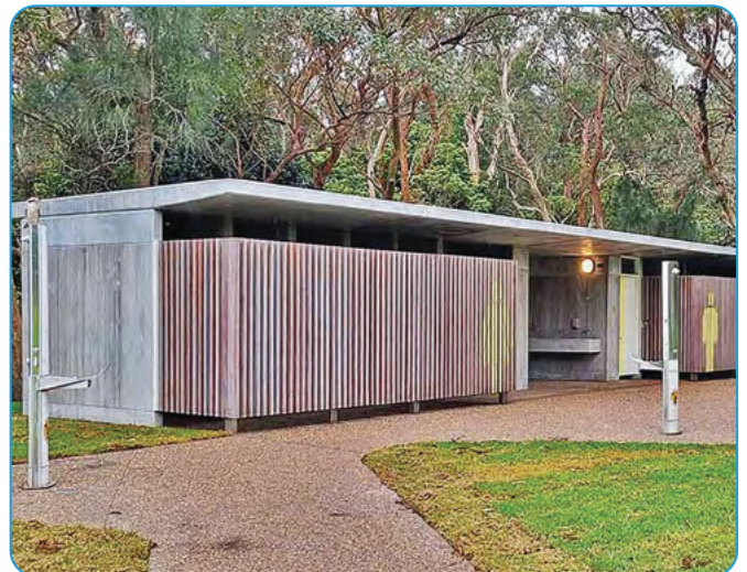
New amenities building at Commemoration Flat

The Cricket Pitch precinct will also be revitalised, with the existing car park expanded and a new amenities building.