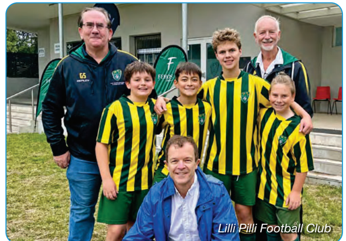
Lilli Pilli Football Club

Cronulla Surf Life Saving Club – electronic security system for rescue training shed – $10,000