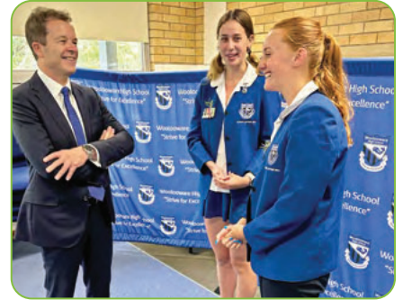
Wooloware High School