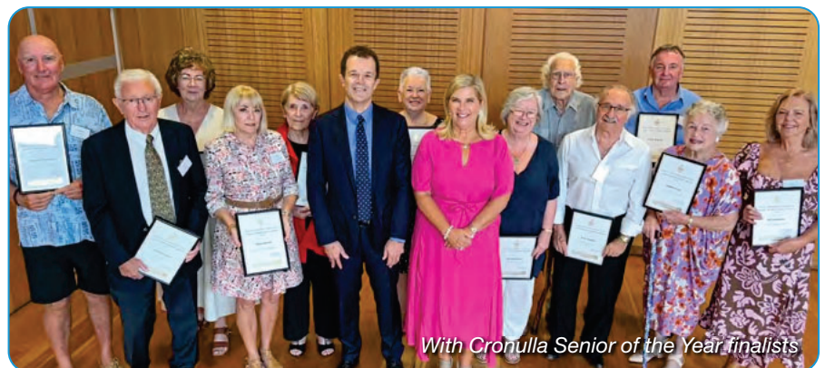
With Cronulla Senior of the Year finalists

Service through physical culture classes.