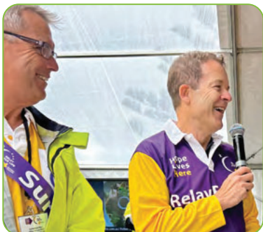
Sutherland Shire Relay for Life