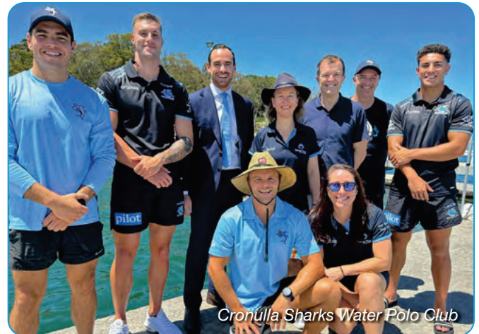
Cronulla Sharks Water Polo Club

Lilli Pilli Football Club – monitored defibrillators at club grounds – $11,980