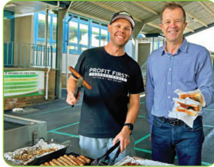
Burraneer Bay Public School