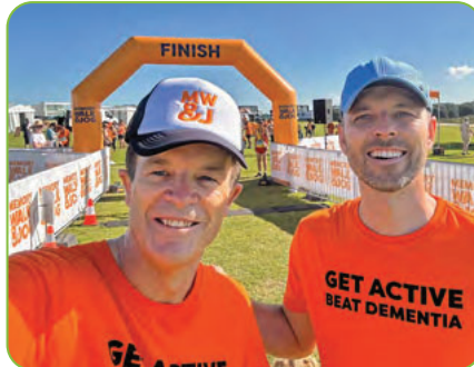
Dementia Australia Walk, Wanda