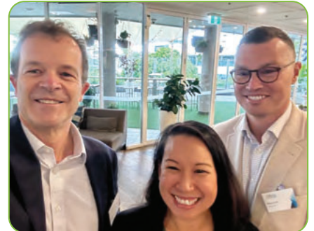
Cronulla Chamber of Commerce