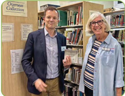
Botany Bay Family History Society