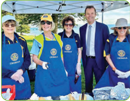
Cronulla Rotary Club