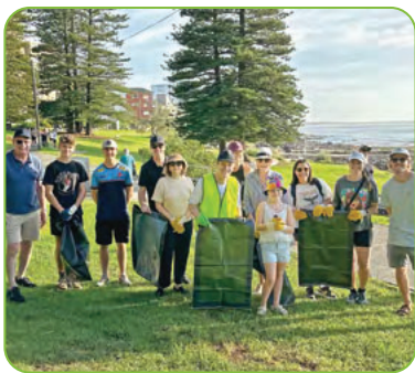
Clean Up Australia Day