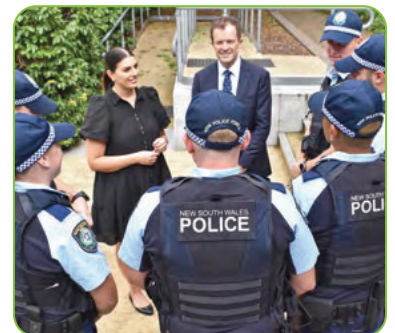
New Shire police recruits

Mark Speakman MP for Cronulla | NSW Liberal Leader